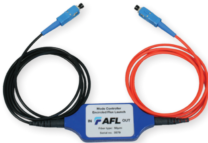
Encircled Flux (EF) Mode Controller

EF Compliant solutions available, see pages 3 - 4 for details