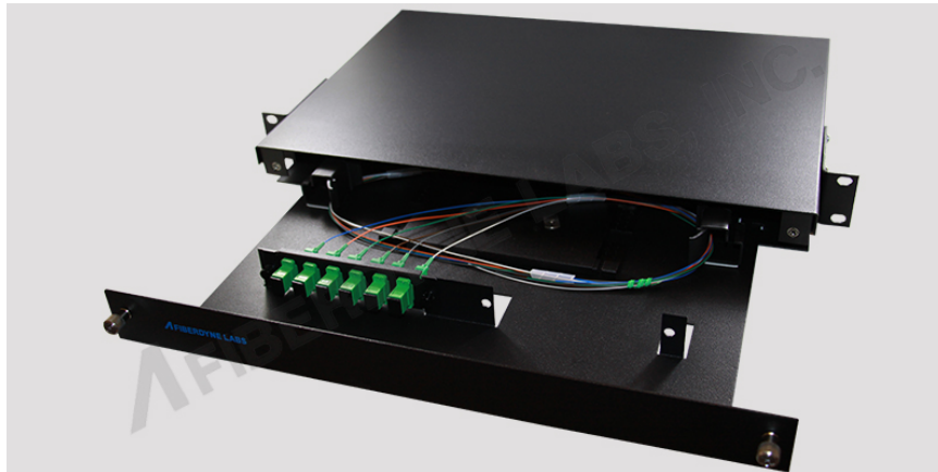
1U High Distribution Center

Fiberdyne Labs offers a complete line of fiber termination boxes. Fiberdyne brand and Corning brand fiber termination boxes are available loaded with preconnectorized jumper style multiple fiber cable or a preconnectorized pigtail for splicing.