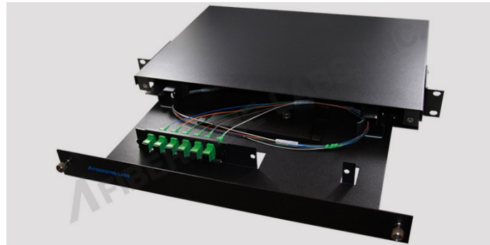
1U High Rack Mount Distribution Center