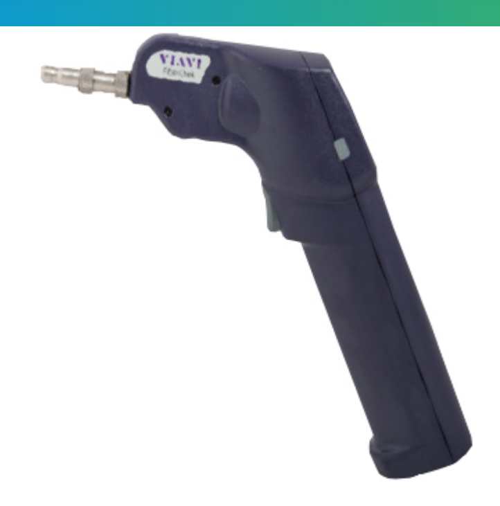
FiberChek™ Probe Microscope