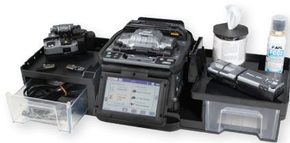
In Work Tray

The Fujikura 90R is the mass fusion splicer workhorse of the splicing world. As data demand continues to rise, the solution to handle the increased traffic is to increase fiber counts. As a result, fiber counts being utilized in enterprise data centers, campus, and metro networks have grown enough to make single fiber splicing too costly and timely. High density cabling made possible by SpiderWeb Ribbon® (SWR®) and others like it are spurring ribbon splicing activity in places that have traditionally used loose fiber. The 90R is the answer to these changes in splicing demand. With automated splice start, tube heater, wind protector, cleave tracking, and blade rotations for up to 2 cleavers at a time, this splicer frees up operator time for other fiber preparation steps. New to the 90R, you can keep your splicer in the field longer with field replaceable V-grooves. When V-grooves can no longer be cleaned after extended use, or are accidentally damaged, you can resume splicing in minutes by installing the spare set included with your 90R kit. Put our 90R to the test by contacting us to see its capabilities first-hand, 1-800-235-3423.